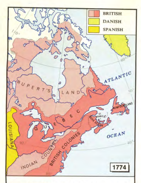
St. John's Island is separated from Nova Scotia (1769). The Quebec Act (1774) enlarges Quebec to include Labrador, Anticosti Island, Madeleine Islands, and Indian Country to the north and to the west and south to the