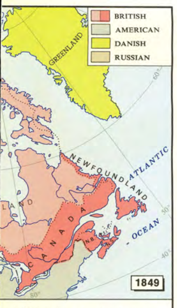
anada (1841). The international boundary from the ty (1846). The Hudson's Bay Company is granted he northern portion of the Oregon Territory), with 8).