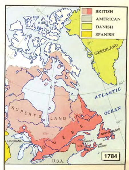
The United States of America gains independence from Great Britain by the Treaty of Paris (1783), U.S.A. boundaries are described from the Atlantic to Lake of the Woods, New Bruswick and Cape Breton Island are separated from Nova Scotia (1784).